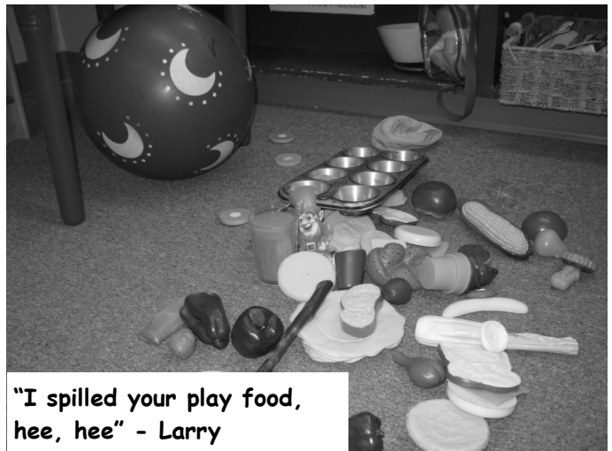
"I spilled your play food, hee, hee" - Larry

We finished of the Month learning about Easter. We made bunnies, Easter wreaths, baby chicks in shells and decorated Easter eggs. We finished up the theme with an Easter party. We even had a visit from the Easter Bunny who left us treat filled eggs all around the Daycare!